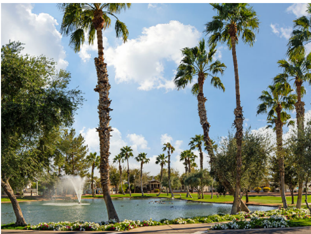
Palm Creek Resort in Casa Grande