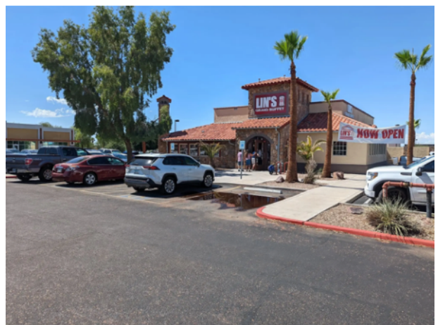
Lin's Grand Buffet